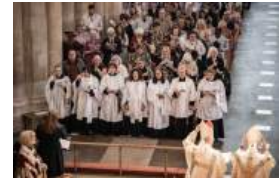
Congratulations Ordination news