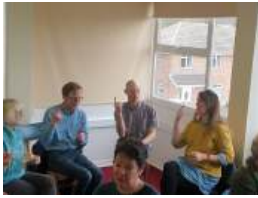
Featuring Workshop news