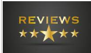
Featuring Comments and stats