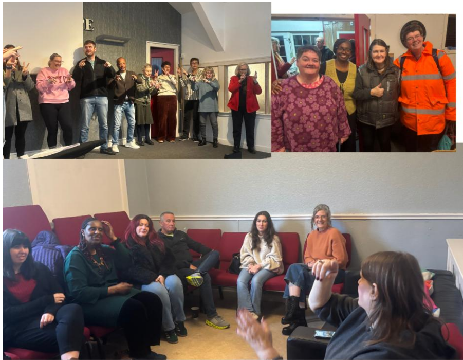
Participants at the Glasgow Workshop